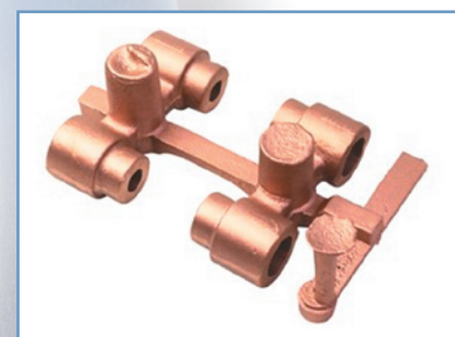
Picture 5. The desired bronze cast model.