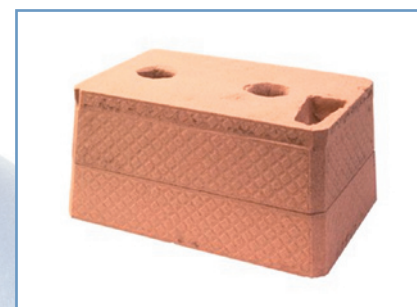
Picture 4. The pattern is removed from the flask.