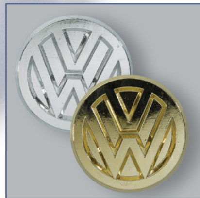
Picture 6. Vacuum metalizing samples