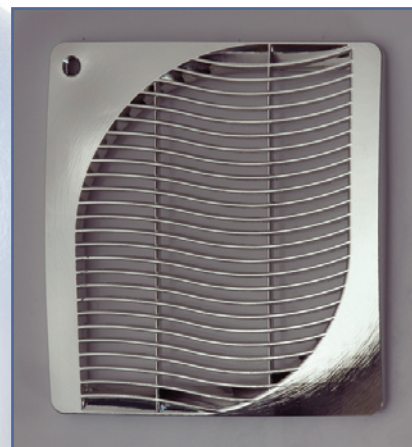
Picture 5. PolyJet model coated with chrome finish