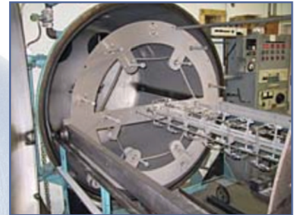
Picture 1. Chamber ready for fixtures

There are eight to ten major steps in the vacuum metalizing process. A typical application may take between two to three hours for completion. The substrates that work well for vacuum metalizing include