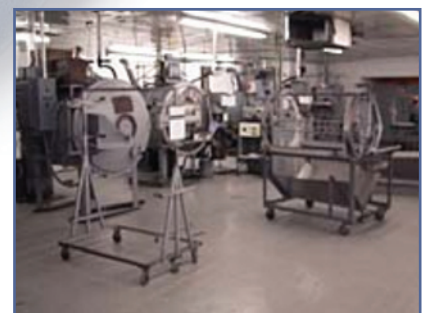
Picture 3. The vacuum chamber